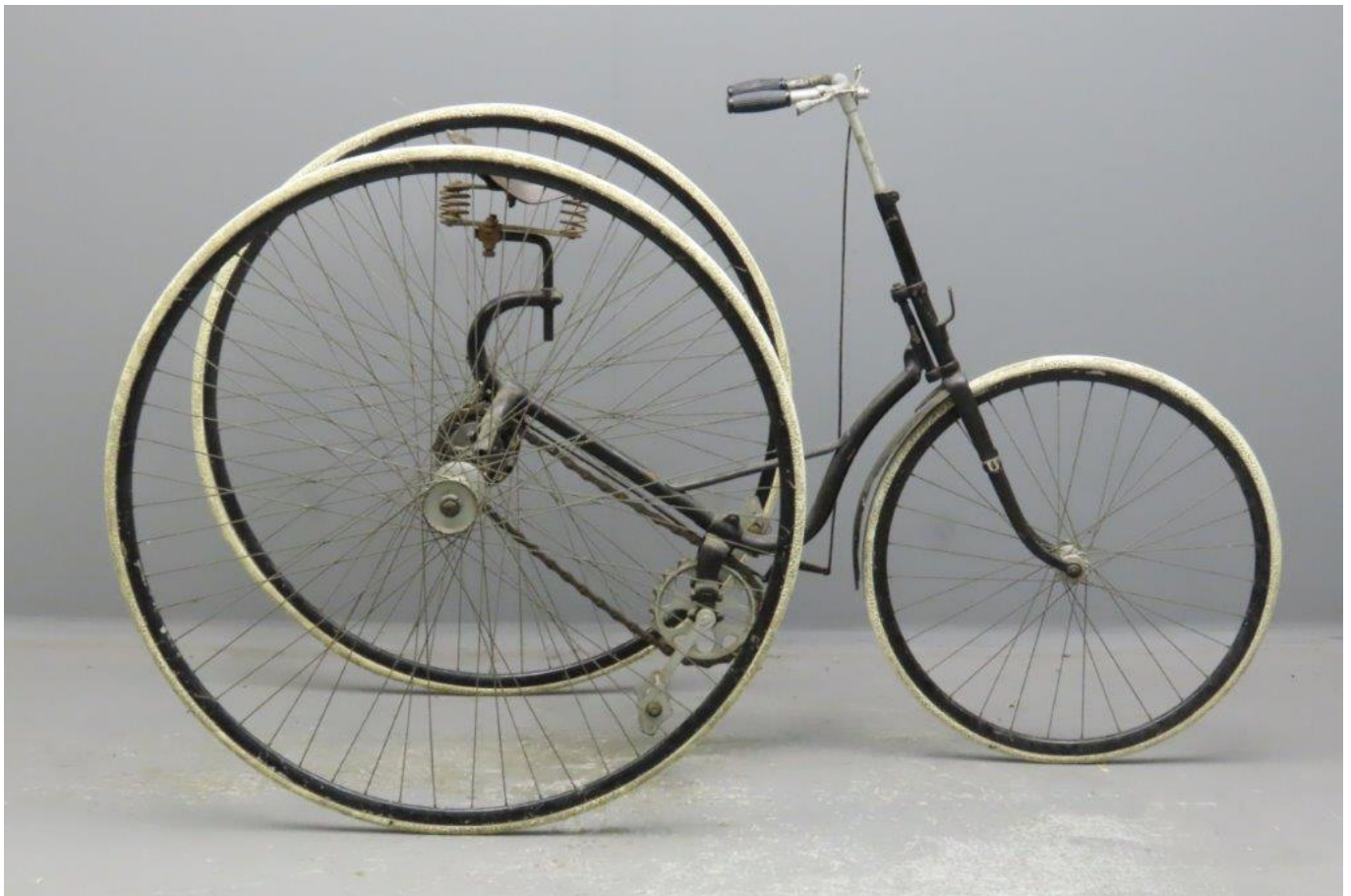
Sparkbrook ca. 1889 Light Touring Tricycle

The Sparkbrook Manufacturing Co. was situated at 72-74 Payne's Lane in Coventry and built bicycles from 1883 till 1926.